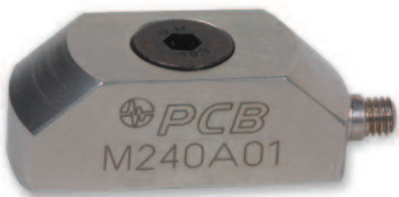
Series M240 ICP® Strain Sensors

As with all PCB® instrumentation, this equipment is complemented with toll-free applications assistance, 24-hour customer service, and is backed by a no-risk policy that guarantees satisfaction or your money refunded.