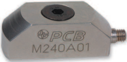
Series M240 ICP® Strain Sensors