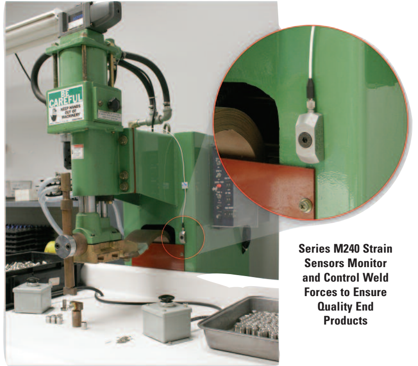
Series M240 Strain Sensors Monitor and Control Weld Forces to Ensure Quality End Products