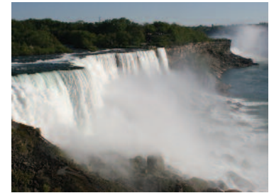
Training attendees enjoy a sightseeing tour including spectacular views of Niagara Falls. This photo was taken during the May 2009 event.